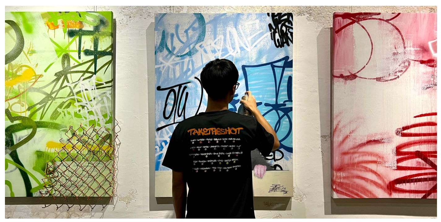
TAZONE working in the studio, 2024